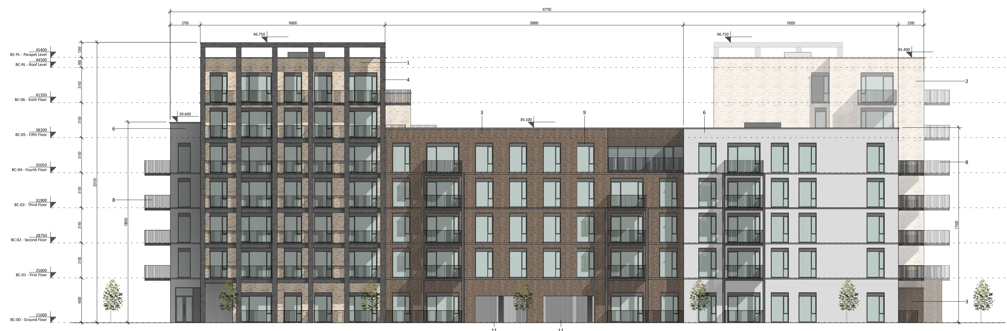
2 BC West Elevation 1:200